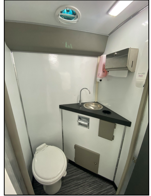
Note: Photos do not depict actual mobile unit. It is an example of what PHC wishes for.